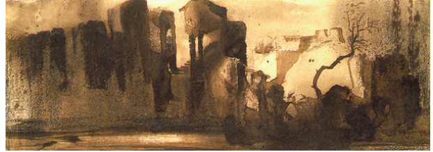
Victor Hugo, Ruines dans un paysage imaginaire , 1845- 47

For Immediate Release: December 18, 2008