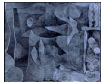
Paul Klee, Morgengrau . 1932.

For More Information: 212-755-7288 or visit http://www.krugier.com/artbrut/